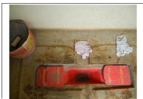
Plate 1: Ecosan toilet with ash container and squatting pan

The Ecosan Toilet consists of the following components: Substructure and superstructure Plate 1 shows the inside with the ash container and squatting pan. The side section view Ecosan toilet for Double Vault toilet is presented in Figure 1.