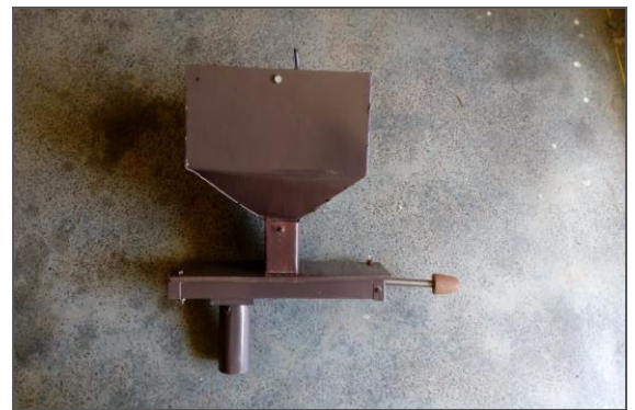
Plate 5: Ash Dispenser: Side View