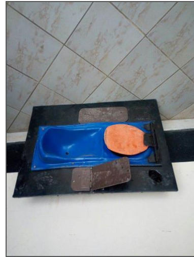
Plate 4: Mechanized Pan: Side View